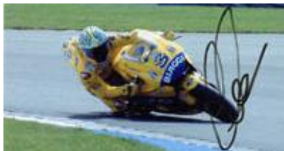
MotoGP rider Max Biaggi