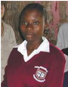
Rhoda Muye Ribe Girls Secondary School