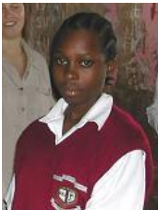
Naomi Muye Ribe Girls Secondary School