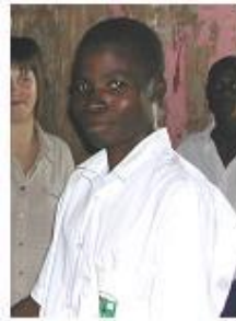
Joseph Mwabeja Lutsangani Secondary School