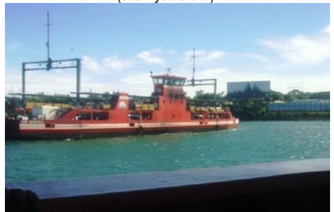
Touring the docks near Likoni Ferry by boat