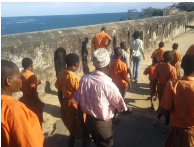
Walking at Fort Jesus