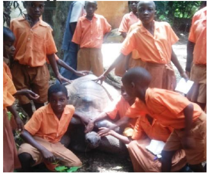
Meeting the giant Tortoise at Haller Park (300 + years old!)