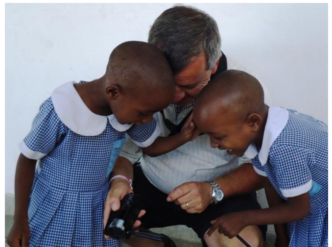
Meeting children at Tumaini Childrens' Home (HIV/Aids Orphanage & school in Mombasa)

A typical day out to Kadzinuni for visitors staying at the tourist hotels in or near Mombasa includes: