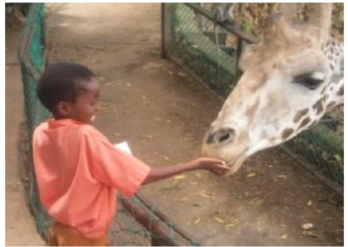
Feeding giraffes at Haller Park Nature Reserve