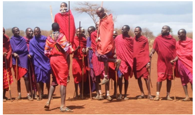
Meeting Maasai tribesmen on safari

They are so very open about their own failings which they talked about although you could clearly see and feel that they aspire to improving their own lives; not want to be dependent upon outside support. Meeting the students we support was brilliant. It was lovely to talk to them about their progress at school and we could see how the opportunity our sponsorship provides is making a difference. We had a great time on safari, but if we return it will be because we are drawn to the people at Kadzinuni."