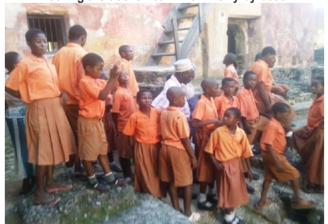
Tour of Mombasa “Old Town”