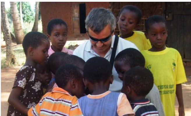
Oh, how they loved to see themselves on video!