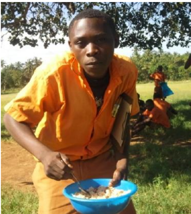
Lunch is served!

The idea that just £76 will feed 90 children for 4 days, so that they are not tired and hungry during their exams was a "no brainer" for us, so we duly dispatched the funds.. Once again within a few days receipts and photos arrived from Patrick.