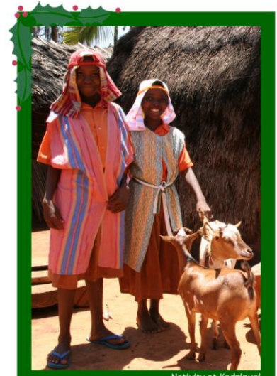
Right – Design 2 “Shepherds”