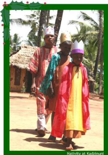
Left – Design 3 “Wise Men”