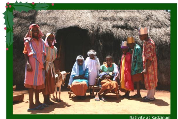
Right – Design 4 “Nativity”

All designs are 10 x 15cm, 350gsm silk finish high quality card.