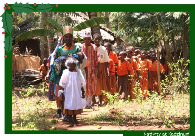
Left – Design 1 “Procession”

Charity cards with 100% of what you pay going to the front line!